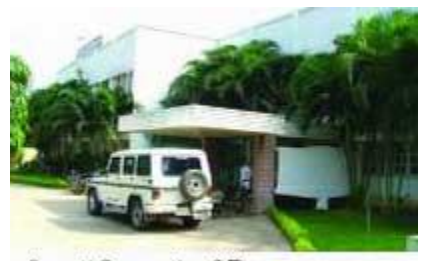
Panruti Corporation Office

Punruti is a town in Cuddalore district of tamilnadu.